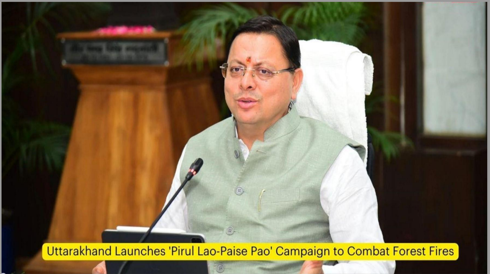
Uttarakhand Launches 'Pirul Lao-Paise Pao' Campaign to Combat Forest Fires